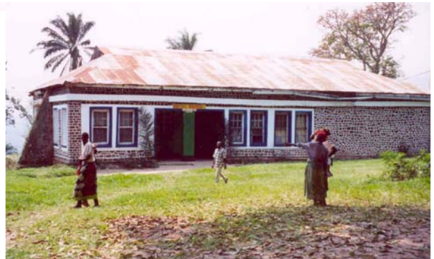
Bibanga Hospital, Democratic Republic of Congo was one of seven mission hospitals in DRC to receive grant funds in 2007.

Funds awarded in the annual IHM/MBF grant process do not include gifts from congregations and individuals to Extra Commitment Opportunity Accounts that are designated for specific institutions and programs.