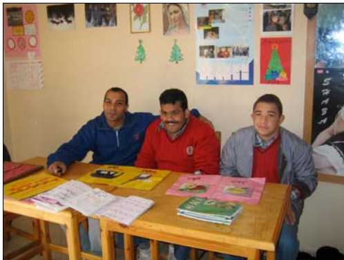
The Fairhaven School in Alexandria, Egypt is a center of compassionate training for mentally challenged young people. Skills training includes carpentry, candle making, sewing and gardening.

Two diverse contingents of new and veteran mission co-workers, congregation mission leaders, representatives of the Medical Benevolence Foundation and staff of IHM traveled in Egypt, Thailand and India recently, deepening their understanding together of how PCUSA's partners are working to address the health and development issues of their communities.