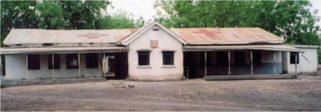
Akobo Hospital is one of the health institutions that will benefit from a collaborative initiative to provide health services to impoverished South Sudan.