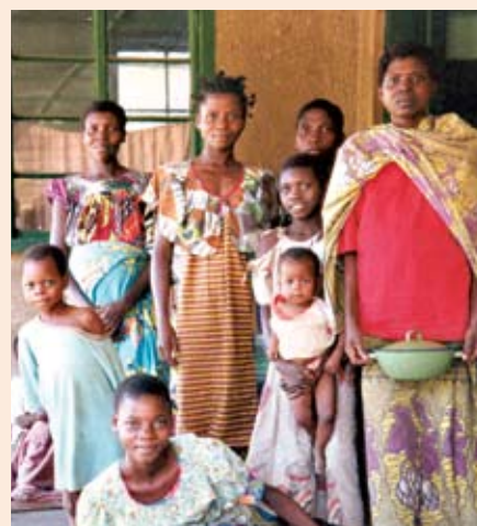
Responding to the health issues of women and children in the Democratic Republic of Congo is a priority for International Health Ministries and its partners in DRC.